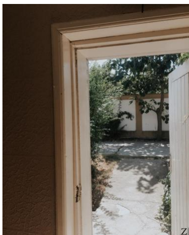
Figure 1 – Photo / Image depicting the migration journey

“In my perspective, no one in the world is content to leave their country, people, and society. We do it to achieve our goals in life and to take the chances that are not obtainable in our countries. Although not all doors we encounter are open doors, there will always be one, and that’s the golden opportunity we run towards. This golden opportunity might be a new job, new position, new home... mine was migration.” (Lebanese migrant living in Romania, 22 years, Female)