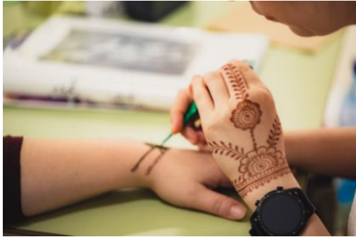
Figure 7 – Arabic Cultural Festival, Sibiu, 2-4 September 2022

“I arrived in Sibiu as a result of the war in Syria. Soon after, I enrolled in college and got to know the city and its people. I immediately realized that most of my Romanian colleagues and friends understood the Arab world in terms of bombs, shawrma, desert and camels. By establishing the Arab Cultural Center in Sibiu, I proposed to make at least some of these aspects of the culture and civilization of the Arab peoples known in Romania.” (Syrian immigrant living in Romania, 32 years, female).