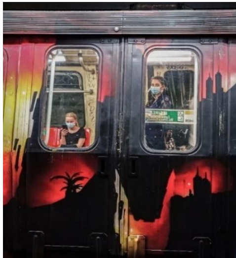
Figure 2 – Exposed to a discriminatory situation

"I didn't pay attention to those around me, but the first time I tried it, about a year after my arrival in Romania, I was drawn to that look directed at me with hatred. And then I was exposed to a racist situation, a man pushed me on the stairs of the metro. I was afraid, I didn't approach people on the street. But I didn't stay long in this state, perhaps because of my love for life and discovery." (Palestinian immigrant living in Romania, female, 23 years)