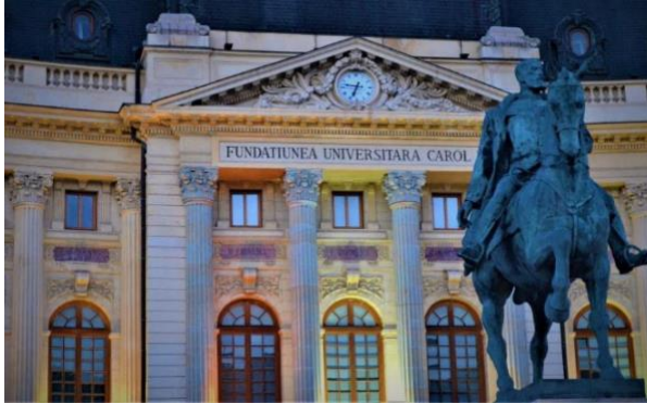
Figure 6 – Education, the powerful weapon

“I photographed the Central University Library to show the things I like most about Romania, Bucharest. The two reasons