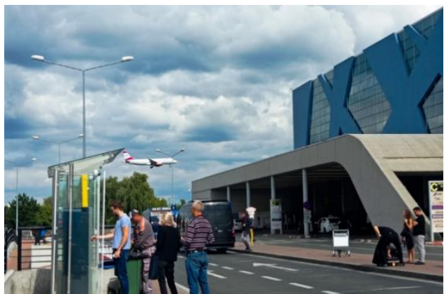
Figure 2 – Photo / Image depicting the migration journey

“After 21 years, for the first time, I boarded a plane. When I saw it, it was so close to the people that they did not seem to be afraid of it, but I was overwhelmed with awe and astonishment. The planes I saw from my childhood were military planes loaded with missiles to kill us.” (Palestinian migrant living in Romania, 23 years, female).