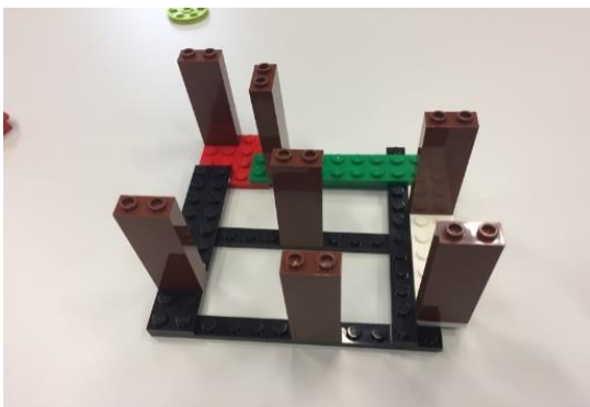
Photo 1: “Getting lost in Luxembourg” (Warm-up model on the first experience in Luxembourg)

We developed a LEGO® Serious Play® workshop to empower young migrants in vulnerable conditions that we first piloted with a group of 8 international students at the University of the Greater Region- Master in Border Studies at the University of Luxembourg. The students were asked to build in different steps a joint vision of how an integrated society in Luxembourg could look like. The student had given consent that pictures were allowed to be taken of their LEGO® Serious Play® models, and we were allowed to register their “storytelling” about their individual models as well as of their joint models. The workshop took four hours and showed that using LEGO® bricks was unfamiliar to all of them. Therefore, the warm-up phase needs especially attention when dealing with participants from different cultural backgrounds.