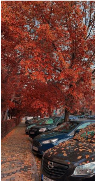
Figure 4 – The beauty of nature as a coping strategy

“The first thing that attracts a foreigner is the charming Romanian landscape: mountains, seaside, woods, parks, etc. Romania is a country where we can still breath fresh air, without suffocating pollution. Those who love nature will be pampered here, just like me!” (Algerian immigrant living in Romania, 29 years, female)