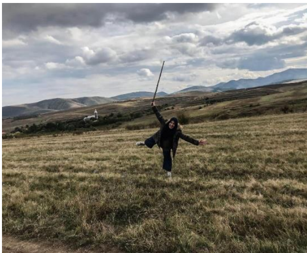
Figure 5 – The beauty of nature as a coping strategy

“I was really different from those around me, I just started looking for what I love from nature, discovering and experiencing that first feeling that I've been waiting for 21 years.” (Palestinian immigrant living in Romania, female, 23 years).