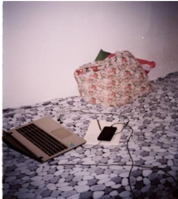
Figure 3 – Feelings of loneliness and isolation

“The life of a young migrant student in Romania. It's a photo from my college dorm room. It was actually taken during online studying. So sometimes it was hard to get to know Romania or get acclimated while only sitting in my room.” (Moldovan immigrant living in Romania, female, 20 years)