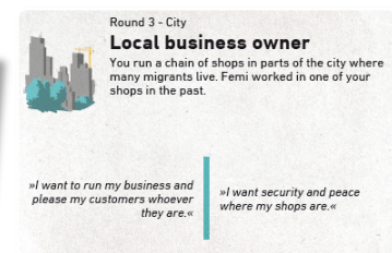
Examples of future outcome & role cards