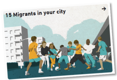
Examples of event cards