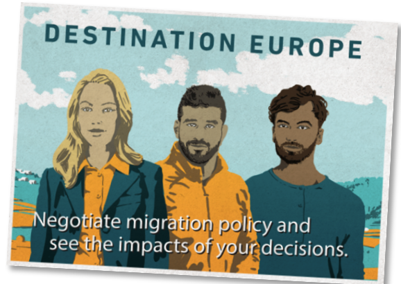
Cover of the Northern, western, and southern EU edition (left) & the Central and eastern EU edition (right)